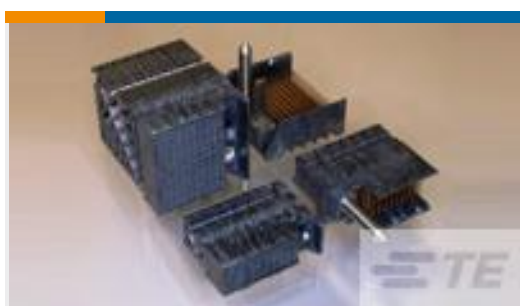
TE Part # 2057764-2 IMP100S,H,V3P8C,UG,OEW39,4.9